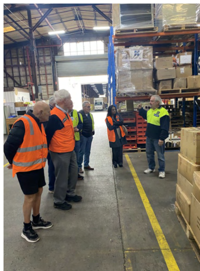
Club visit to Donations in Kind