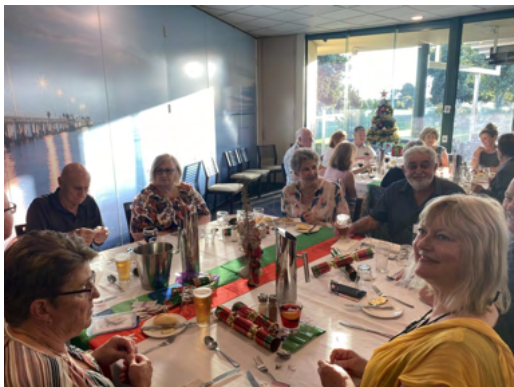
Christmas Break Up