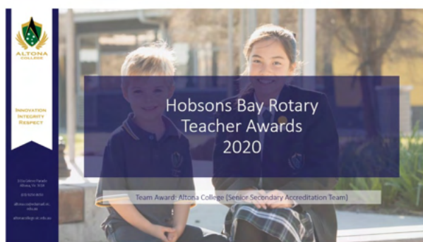
Altona College presentation at Teachers Awards