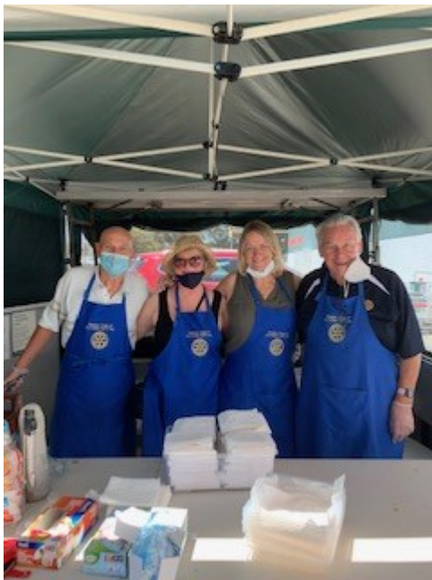
Sausage Sizzle during COVID restrictions