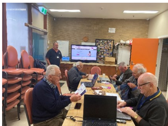
Hobsons Bay Men's Shed - IT training