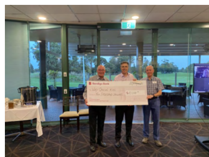
Cheque for $10,000 handed over to Very Special Kids at a recent club meeting