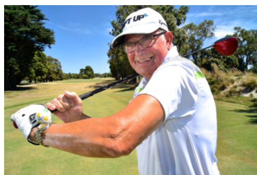
No caption required