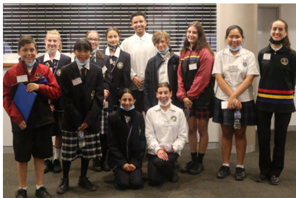
Participants of Wynspeak Heat 3 at Altona Theatre