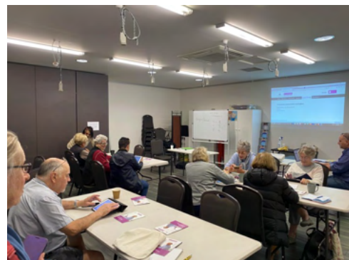
Be Connected Project April 2021