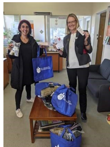
Latitude—Donations for the needy