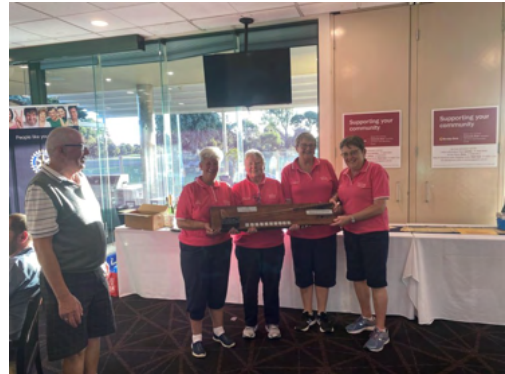
Very Special Kids Golf Charity Day 2021