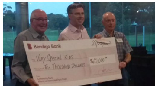
Cheque Presentation to Very Special Kids