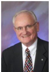
PRID Phil Silvers 5500