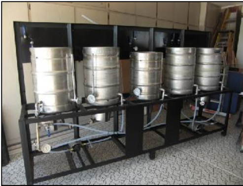
SCW Zymurgy Brew System

SCW Zymurgy Club has received the opportunity from the Recreation Centers of Sun City West to remodel a space for a state-of-the-art crafting facility for beer and wine that will contain a • Brew System • Fermentation area • Walk-in Cooler • Indoor Work Area with Sink and a • Courtyard with Brew System, Sink and Cooking Burners. The facility will be off of Meeker Blvd. in the RH Johnson Lower Activity Center by The Bocce Courts. Zymurgy Club has committed to paying 50% for the facility on its own. Therefore, we are seeking donations and pledges to build and furnish the facility.