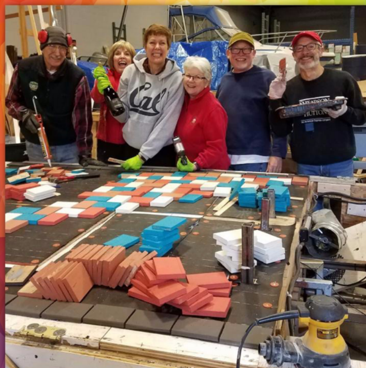
Having a good time constructing the 2019 Royal Rosarian traveling float.