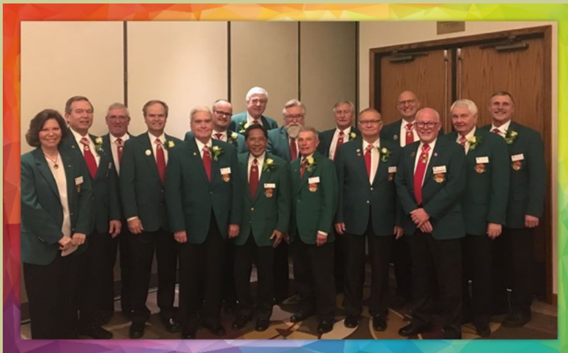
The Royal Rosarian Dukes and Duchesses were celebrated at the March 7 Membership Meeting. Sixteen Dukes and Duchesses were on hand to be honored by the 125 attendees.