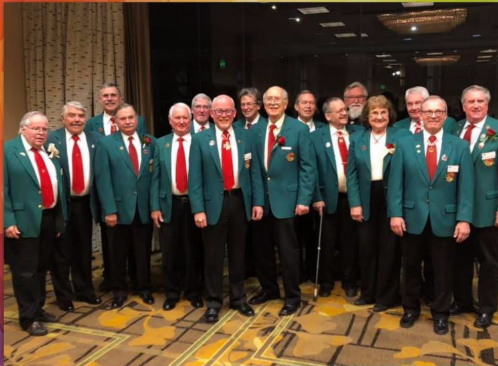
A number of Life Members turned out to be honored at the February Membership Meeting.