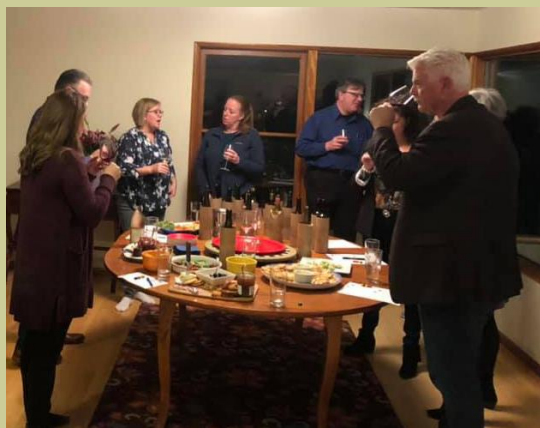
The hard working wine committee, but somebody has to do it.