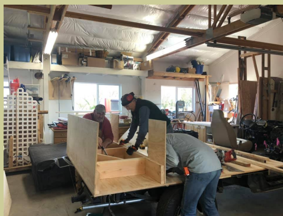
The traveling float is starting to take shape. Help is needed, so keep an eye out for work party announcements in the Tuesday Report.