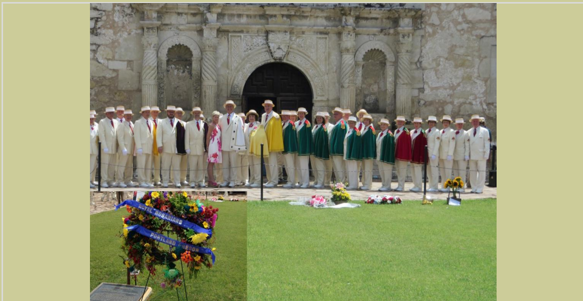
Royal Rosarians at the Alamo for a ceremonial wreath laying in 2016.

Fiesta San Antonio is a celebration of San Jacinto Day. It honors the memory of the heroes of the Alamo and the Battle of San Jacinto. This historic commemoration began as a single parade in 1891 and has evolved into one of the nation's premier festivals, celebrating San Antonio's rich and diverse cultures.