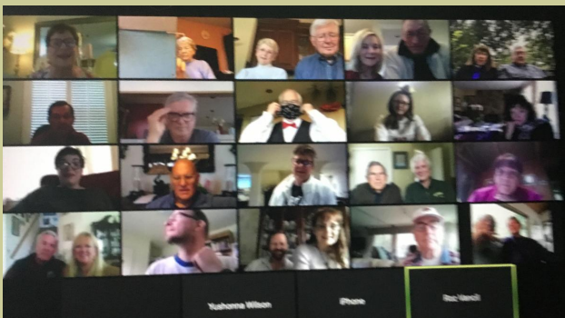
Rosarians mixed their own and have turned out via Zoom for the Saturday Virtual Social Hour which will continue on Saturdays at 5:30 pm through June.