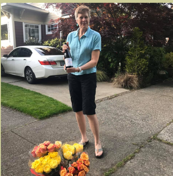
A surprised and overwhelmed Prime Minister shows off the bottle of wine presented to her by a parade participant.