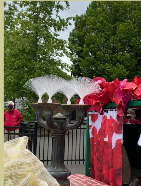
A genuine Benson Bubbler decorates the traveling float.