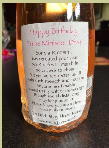
A poem wishing Prime Minister Kimberly a Happy Birthday.