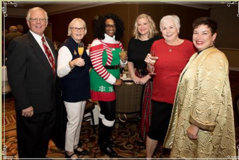
A little social time before sitting down.