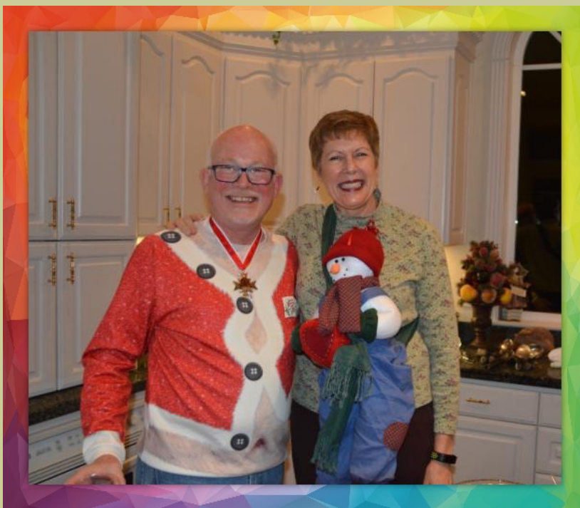
Prime Minister Don and Lord High Chancellor Kimberly enjoying the recent Purely Social potluck.