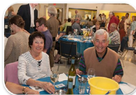
Ready for the Lobsters