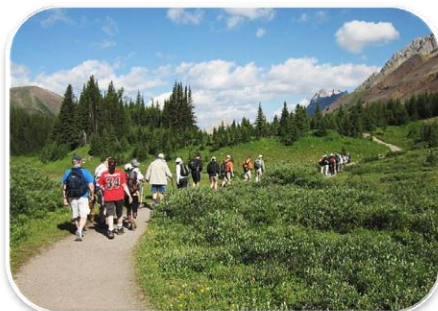
Rotary Mountain Fellowship