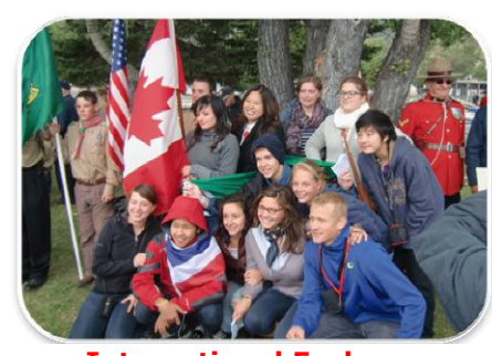
International Exchange Students at Waterton Peace Park