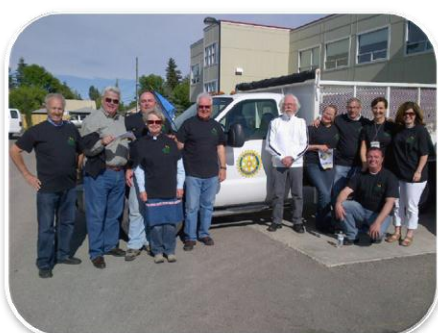
TJSIS collaboarion with Oklahoma Rotarians