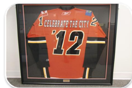
Calgary Flames Celebrate the Rotary Club of Calgary