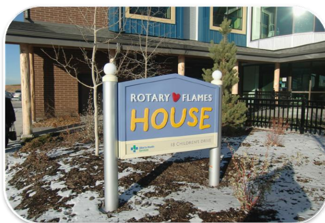
What a great Rotary legacy