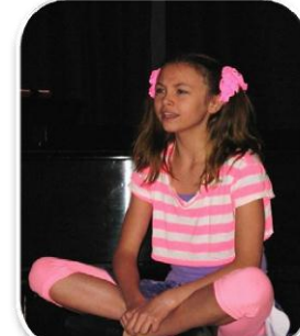
Performing Arts RCC bursary winner