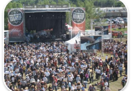
Raising money the fun way with Stampede week BBQs