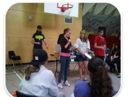
Stay-in-School program expanding