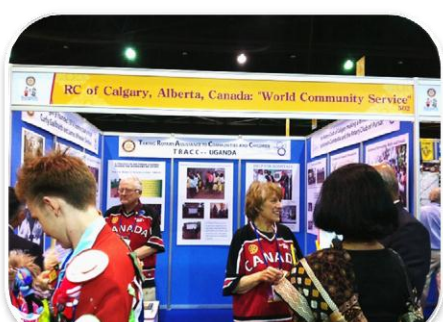
Sharing in Bangkok