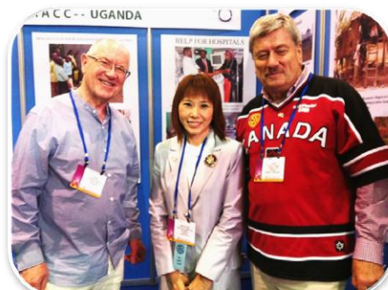
End polio now - we are sooo close