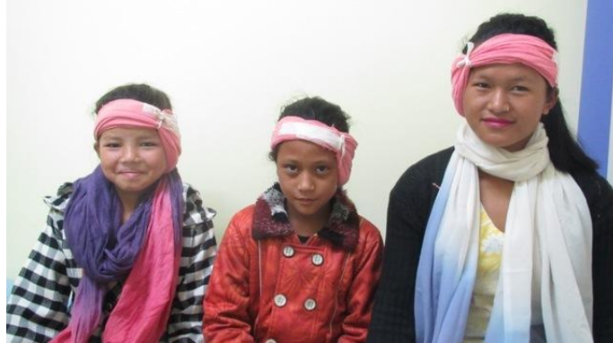
Children in outpatient's department for follow up after ear surgery

Following completion of surgeries of 30 children there was remaining fund of Rs.43,000. After receiving permission from The Rotary Club of Potomac-Bethesda it was planned to cover part of transportation cost of Ear Care Nepal's upcoming ear screening camp at Solukhumbhu district. Ear screening camp plays a vital role in prevention of deafness by directly reaching out to the population through primary ear care education programs and helps to identify much neglected cases of deafness.