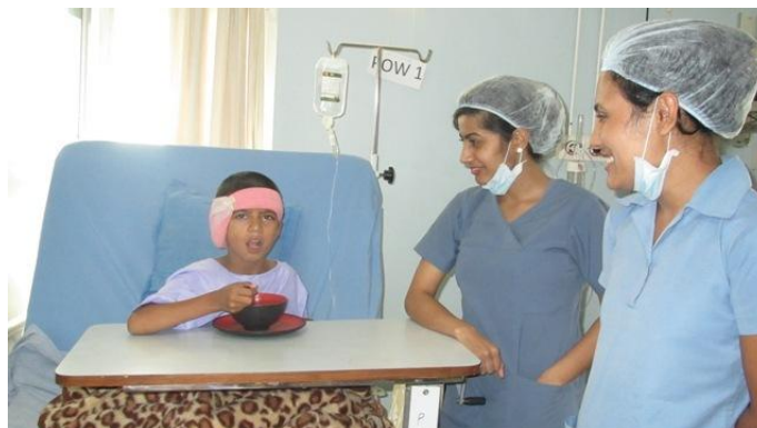
A child recovering from anesthesia in the post operative ward, community ear assistant providing him support