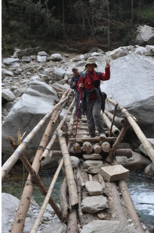
Trails are full of adventure