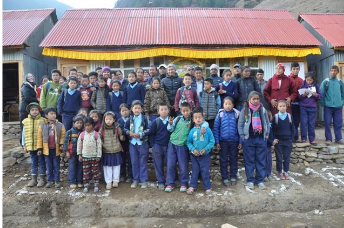
Temporary classrooms of Shree Junbesi Secondary school (main school block is damaged by recent earthquake)