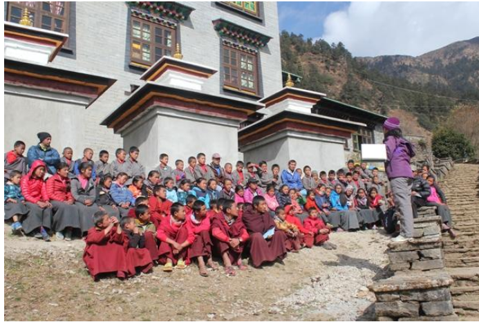
Primary ear education classes were provided to all the children and teachers, in an open air under clear blue sky