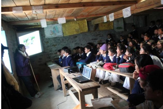
Delivering lecture on primary ear care education to children and teachers at Chheskam