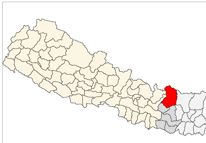
Map of Nepal, Solukhumbhu district high-lighted

Following completion of surgeries of 30 children there was remaining fund of Rs.43,000. After receiving permission from The Rotary Club of Potomac-Bethesda it was planned to cover part of transportation cost of Ear Care Nepal's upcoming ear screening camp at Solukhumbhu district. Ear screening camp plays a vital role in prevention of deafness by directly reaching out to the population through primary ear care education programs and helps to identify much neglected cases of deafness.