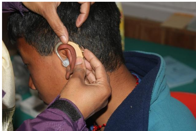
Free hearing aid distribution to children with neural deafness, which cannot be corrected by surgery