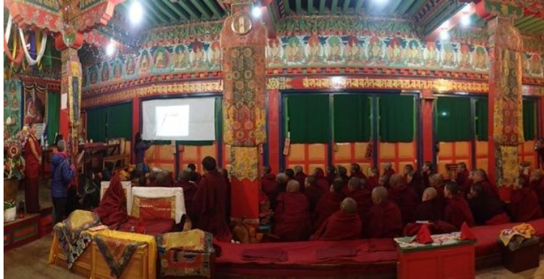
Delivery of primary ear care education to monks/ nuns

Total of 190 school children and 311 monks/ nuns were screened for deafness at Junbesi. Primary ear education was provided to these children, teachers and monks/nuns. Chronic middle ear infection; the main cause of hearing loss is found to be significantly high among these children and monks/nuns. Prevalence of middle ear pathology is found to be 7.68% in school children and 12.36% in monastic children/monks and nuns.