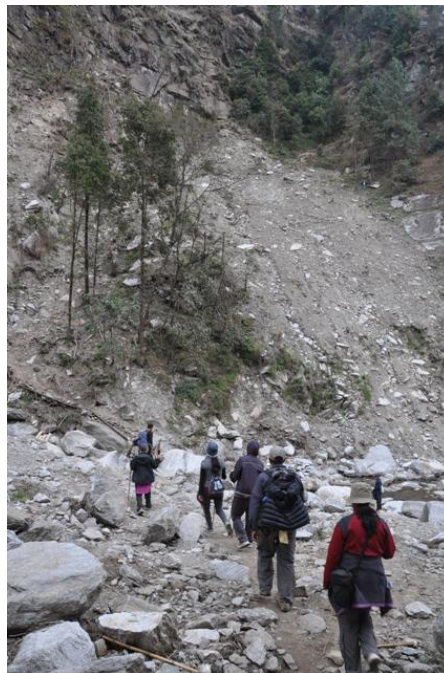
Walking trail to Chheskam is rough and almost non-existing

Following Junbesi, Ear Care Nepal screening team headed to Chheskam VDC. Chheskam is the furthestmost VDC from the district headquarter Salleri. It is four days hard walk along very difficult trail. At Chheskam all the children of Shree Chheskam High School were screened for ear diseases, the only high school in the VDC. Due to its remote location the need for health program seemed desperate. Majority of children are from a marginalized ethnic ground called Kulung, which dominates the village population.