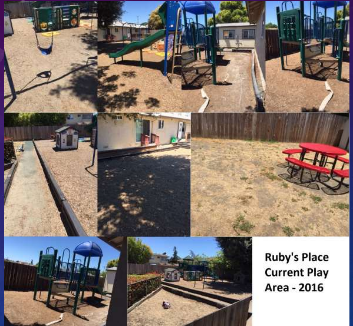
Ruby's Place Current Play Area - 2016