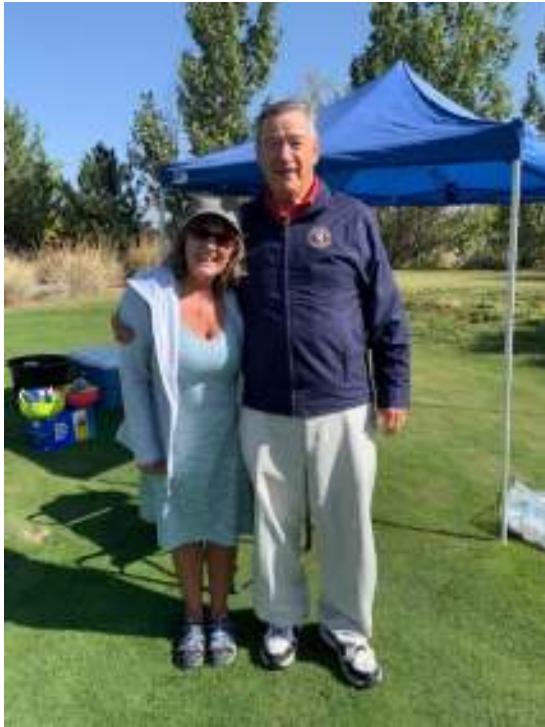
Sparks Centennial Sunrise