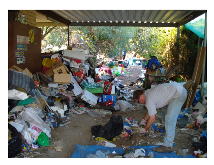
April 2008 Cleanup—Parkers Road