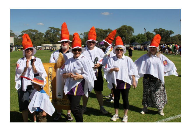
March 2014 Relay for Life

gawlerlightrotary Instagram: @gawlerlightrotary