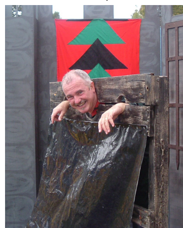
Former Stock Agent November 2008

The proposed district dues for next year are $100.00 per member. This reflects a slight increase in Dues for former members of D9500 and a slight reduction in Dues for former members of D9520.