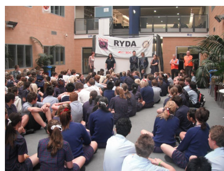
Rotary Young Driver Awareness December 2011