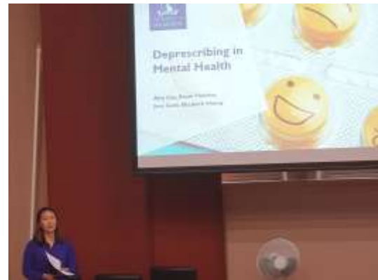
Our 4 PhD Scholars giving presentations on their research