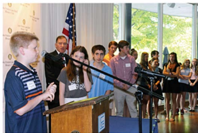
Youth Service Recognition Awards ceremony, an annual event.

We invite you to support the Lake Forest-Lake Bluff Rotary's philanthropic mission. For the past 58 years, the Rotary has given over $1 million to improve the lives of others in our community and our world. You won't want to miss this unique opportunity to promote your business to this dynamic and affluent audience. The Lake Forest-Lake Bluff Rotary Club is part of Rotary International, a worldwide organization of more than 1.2 million business, professional, and community leaders. Members of Rotary Clubs, known as Rotarians, provide humanitarian service, encourage high ethical standards in all vocations, and help build goodwill and peace throughout the world. There are 35,000 Rotary Clubs in more than 200 countries and geographic areas. Clubs are open to all. As signified by the motto Service Above Self, Rotary's main objective is service: in the community, in the workplace, and throughout the world.