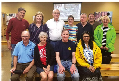
Club members making a difference by helping out at Feed My Starving Children.