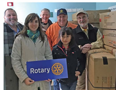
Delivery of winter coats to children in North Chicago and Highwood through Operation Warm - Past 7 years