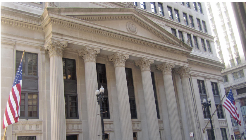
The Federal Reserve Bank of Chicago