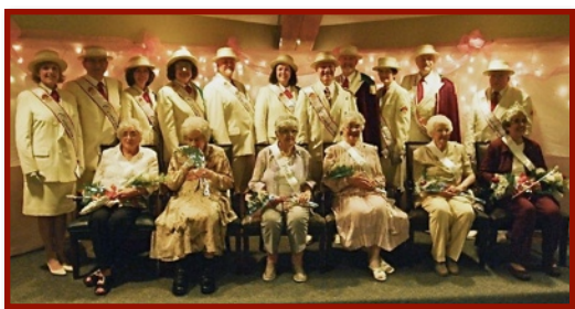
Rosarians escorted two courts at the Cornell Estates Crowning of the Queen.