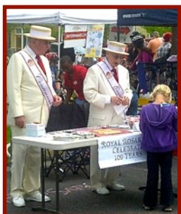
Rosarians answered questions and handed out 4,000 sticky roses at the City Parks Ride.

It was a wet day in North Portland for the Good in the Hood Parade.