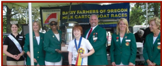
Presenting Awards at the Dairy Farmers of Oregon Milk Carton Boat Races.