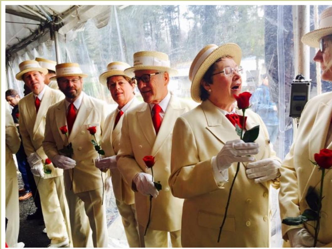
On a gloomy Saturday, February 18, 40 Royal Rosarians turned out to honor Packy, the Portland zoo's iconic resident, with a traditional Rosarian Rose Ceremony at a memorial service held for him at the zoo. Packy, just two months shy of his 55th birthday, had to be euthanized because of untreatable tuberculosis on February 9. Packy was made an honorary knight in the Realm of Rosaria in a Knighting ceremony at the zoo on his 50th birthday April 14, 2012.