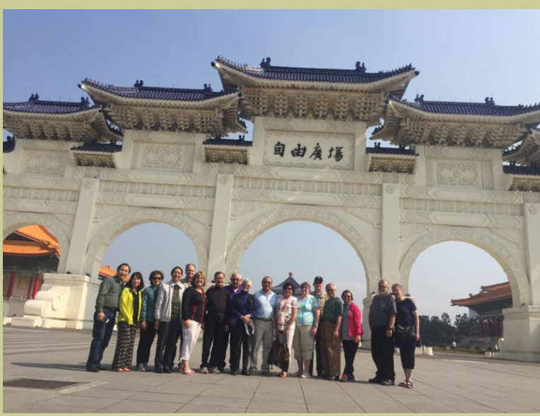
Prime Minister Jim Stahl and First Lady Geneane traveled to Taiwan where they were hosted by Portland's sister city Kaohsiung. They are pictured here being shown with their hosts on tour.