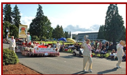
The Royal Rosarians were awarded the Lakefair Queen's Award during the Capital Lakefair parade