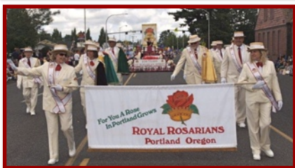
Rosarians march in the Battleground parade