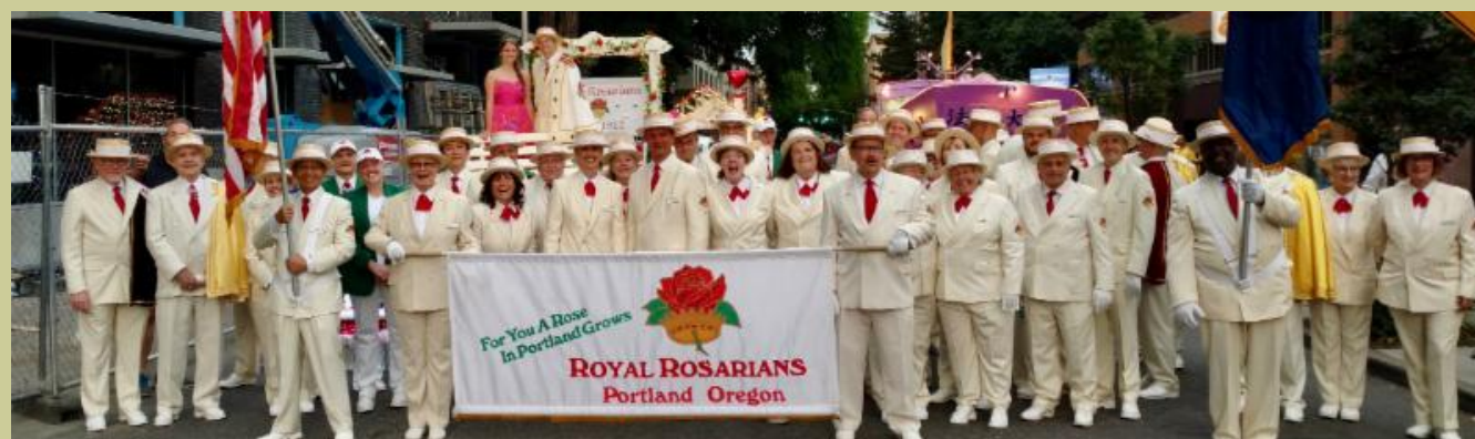
The Royal Rosarians ready to go in the 2017 Starlight Parade.