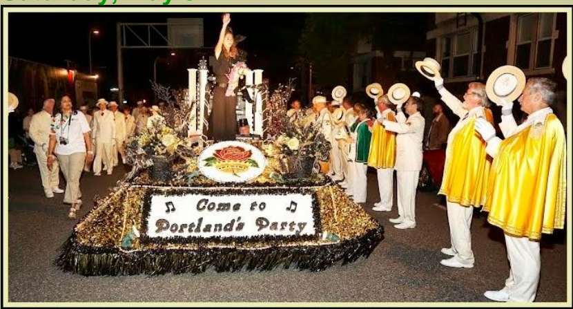
Recent Starlight Parades have been noted for great Rosarian attendance, great summer weather and a great Portland crowd.

Be sure to mark your calendars for the May 31 PGE / SOLVE Starlight Parade. Royal Rosarians come out in force to enjoy the great weather (in recent years) and the abundant and enthusiastic crowd. It really is one of the highlights on the Rosarian calendar and you will want to be there. The Starlight Parade is indeed a special opportunity for all Rosarians to spend time together. Not only do we march in the parade, but we also invite our members to gather before, during and after the parade. Before the parade, there are two seatings for dinner at Gracie's Restaurant inside the Hotel deLuxe. These seatings always sell out, so please contact them directly to make your reservations. During the parade, the hotel will be showing the parade live on high-defenition television in their screening room for spouses and members not able to march with us in the parade.