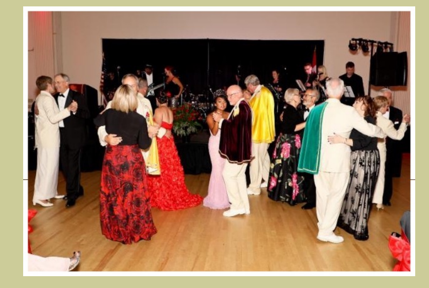
Our new Prime Minister shows one of many talents as he joins the band for a couple of songs. Here he sings Stevie Wonder's "Superstition."