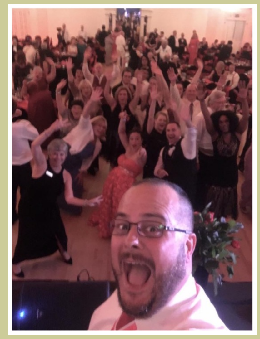
Now that he has the crowd all wound up it's time for a giant selfie. Or is he practicing his best Maori grimace for the Prime Minister's trip to New Zealand?