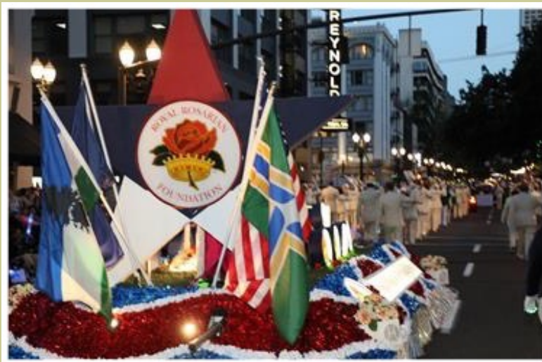
The Royal Rosarian float makes a grand appearance in the Starlight Parade.

Royal Rosarians gathered at Crown Point's Vista House on May 5th to help celebrate the centennial of the landmark. The Royal Rosarians raised the flag at the Vista House dedication 100 years ago and it has been a Rosarian tradition ever since.