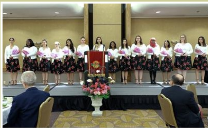
The Royal Rosarians hosted the 2018 Court at the Membership Meeting on May 24. This group of outstanding young women demonstrated why they were chosen to represent their schools