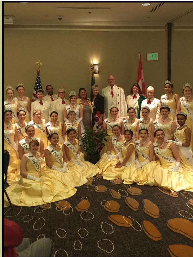
Prime Minister Rick Saturn and First Lady Marie pose among the beautiful royalty of the Daffodil Festival in Tacoma, Washington.